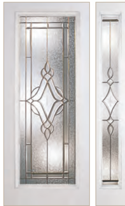
DT00 LUMFL7B ST00 LUMFL1B