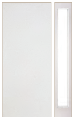
DT00 ST00 FL1