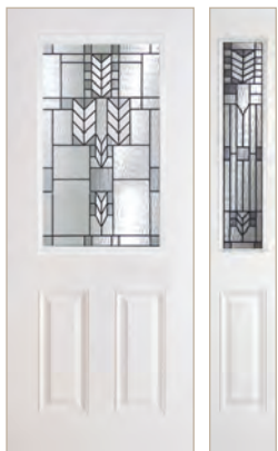
DT61 SPRHL4P ST61 SPRHL1P