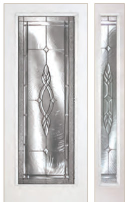
DT00 BREFL7Z ST00 BREFL1Z