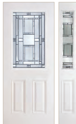
DT61 METHL4P ST61 METHL1P