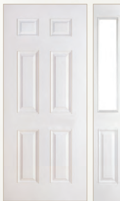
DT61 ST61 HL1