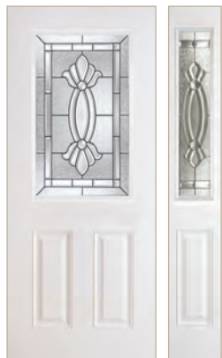
DT61 TIFHL4P ST61 TIFHL1P