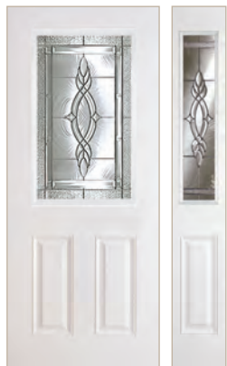
DT61 BREHL4Z ST61 BREHL1Z