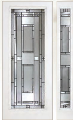
DT00 METFL7P ST00 METFL1P