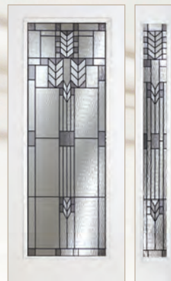
DT00 SPRFL7P ST00 SPRFL1P